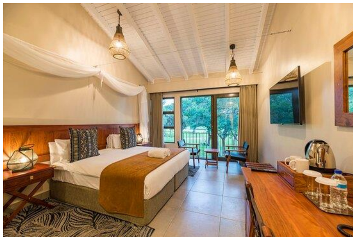
Hwange Safari Lodge

Upon commencing your adventurous journey, the choice of accommodations in the Vicinity of Hwange National Park includes the Safari Lodge and Elephant's Eye, Hwange. Both provide a perfect haven for rejuvenation amidst the beautiful natural surroundings. Afterward, with approximately 934.4 kilometres remaining to reach Kariba, the second leg of the journey encompasses the striking landscapes alongside Lake Kariba.